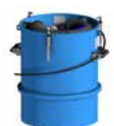
43164101 NCF 5.25, S200, with candle filter