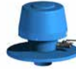
43051002 NE76, with S200 lid and 2 quick couplings. Recommended with filter module 43164101