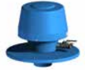
43051003 NE96, with S200 lid and 2 quick couplings. Recommended with filter module 43164101