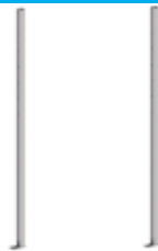
43756001 Leg 1500 mm