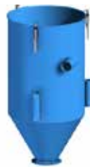
43440023 Silo with abrasion plate and \varnothing 76 inlet