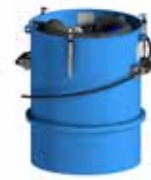
43162101 NCF 3.15, S200, with candle filter