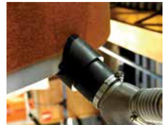
Interchangeable nozzles enable a closed blasting process of any shape

Vacuum blasting is a completely closed and dust-free process where the surrounding area is not exposed to blasting media and dust. During blasting the blasting media is automatically drawn back into the unit, where it is cleaned and recycled. Work can be carried out more effectively with fewer interruptions for refilling of blasting media and the premises do not have to be cleaned after work.