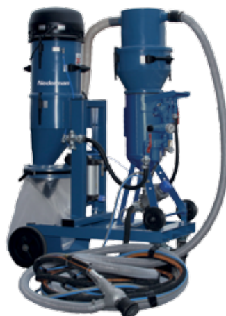
Vacuum Blaster 418A/418E Medium sized unit Blast vessel: 18 lit Pre-separator: 18 lit