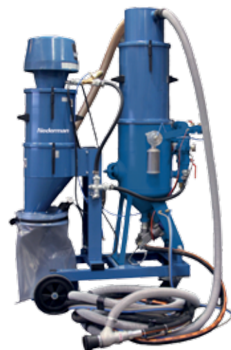
Vacuum Blaster 460A/460E Unit for frequent, heavy duty work Blast vessel: 60 lit Pre-separator: 60 lit