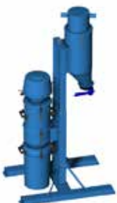
Blasting container with recycling unit

Blasting media can be reused effectively many times. Thus, the economic advantages of recycling are substantial. A recycled media is also faster acting and less dusty, improving productivity and quality, and making the working environment more clean.