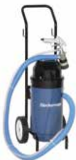
SB 750 Suction Blaster Compact, mobile unit for non frequent usage in small repair shops, etc.

Vacuum blasting is a completely closed and dust-free process where the surrounding area is not exposed to blasting media and dust. During blasting the blasting media is automatically drawn back into the unit, where it is cleaned and recycled. Work can be carried out more effectively with fewer interruptions for refilling of blasting media and the premises do not have to be cleaned after work.