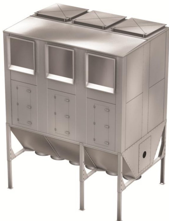
Example: NFPZ3000 3 HJ modules with side and top venting for St2 dust

The filter is designed for small air flows with limited material content.