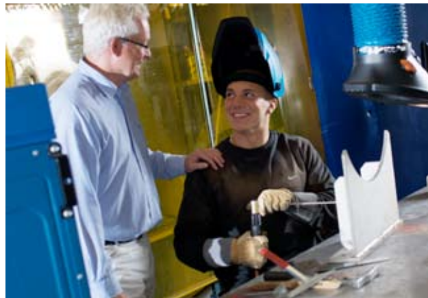
Protection and Safety Courses are frequently arranged at Nederman Educational Centres.