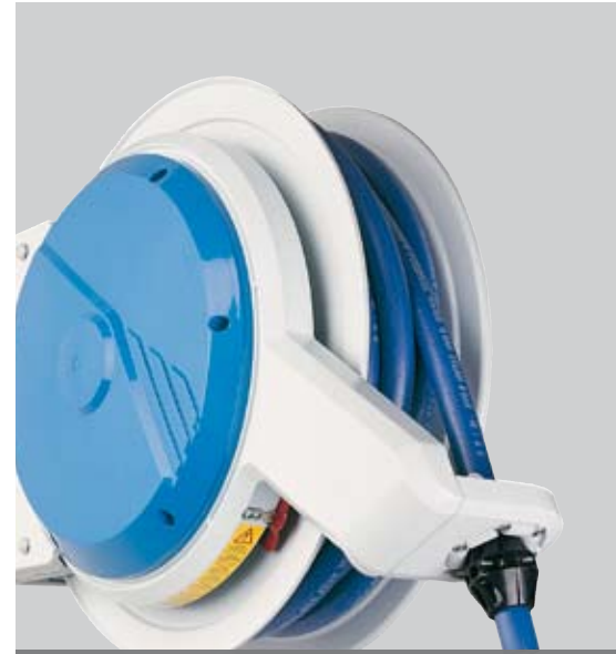
Retractable reels For air, water, power, grease, oil, oxygen/ acetylene, oxygen/LPG etc