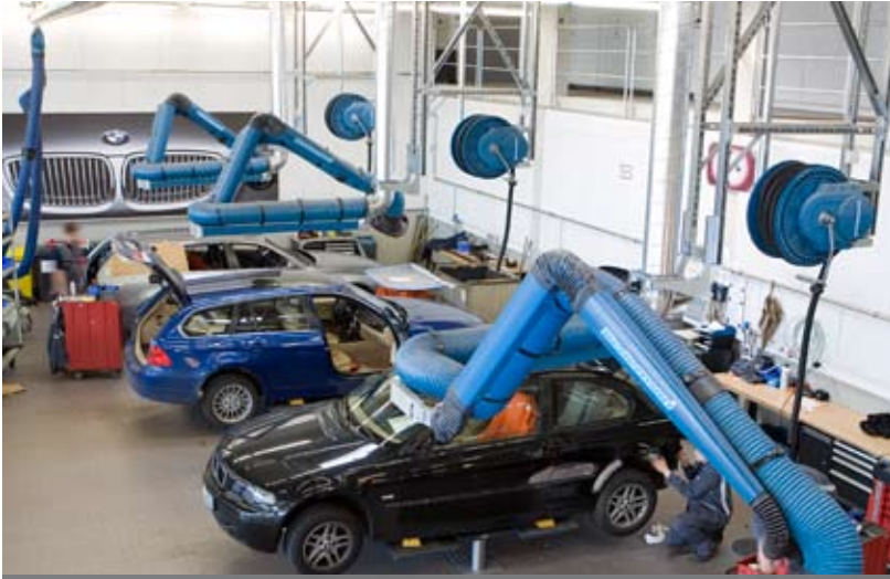
Other Nederman products for efficient, convenient, and economical service