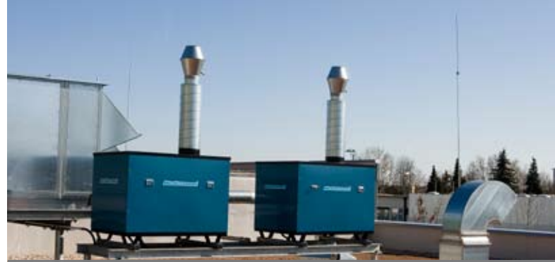
Nederman offers a full range of vacuum units for central systems including filter and duct system. The systems are designed to extract welding fumes, grinding dust, metal turnings, composite materials etc.