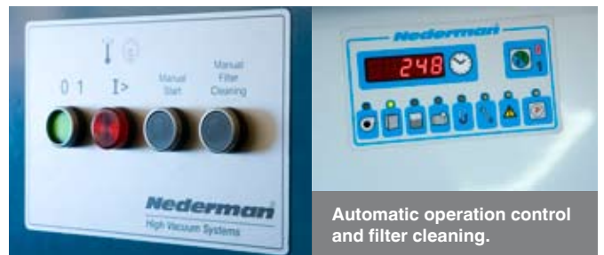
Automatic operation control and filter cleaning.

For further details please have a look at the BMW Workshop Equipment catalogue www.bmw-wep.com or contact your local Nederman partner.