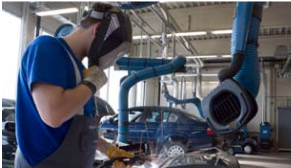
Welding fume extraction A range of arms in different designs and lengths. Can be combined with rails or extension arms that give an extra reach.

With premium class cars follows premium class service – that’s indisputable. That’s why BMW Service builds their service concept on the very best conditions. A good working environment is not only a question of health and a good working atmosphere. It is as well an integral part of the BMW image. This workshop and service station, designed in close cooperation with Nederman, is a good example of that.