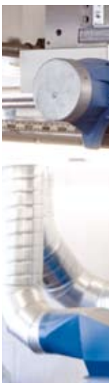
Exhaust Rail s With unique de