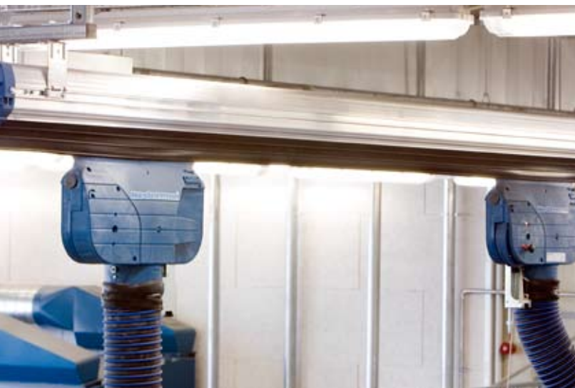
systems design of rail and trolley giving very high extraction efficiency