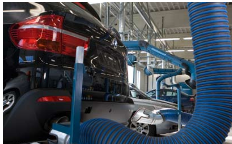
Exhaust Extraction Systems Exhaust Hose Reels, spring driven or motor driven – with special nozzles and funnels for BMW