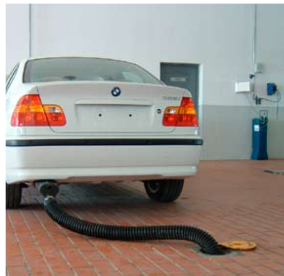
Exhaust Extraction Systems In ground – with special nozzles and funnels for BMW