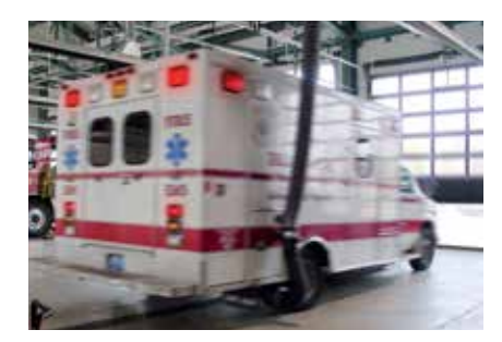
Fastest exit on the market

Fire trucks, ambulances and other emergency vehicles must always be ready to leave the emergency station instantly. Therefor Nederman's vehicle exhaust removal systems with quick release are the optimum choice for your emergency station. The exhaust extraction systems enable quick exit from the emergency station and contribute to safe and effective extraction of exhaust fumes and gases.