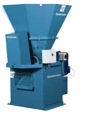
The integrated system crushes the chips, de-oils the chips and recovers