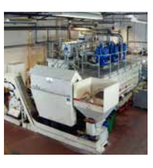
Presses chips from machining into cylindrical briquettes and recovers coolant.