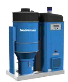
The high vacuum suction system can be used for automatic and manual chip handling and machine cleaning. Chips are removed directly from the machines avoiding unnecessary stops. Premises and machines can also be manually cleaned, improving productivity and preventing accidents.