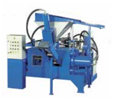
Our coolant cleaning solutions cover most operational requirements. This includes the Presto System that delivers