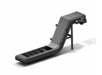
We have a conveyor for every need: Belt Conveyors, Magnetic Conveyors, Drag Conveyors, and Vacuum Conveying Systems.