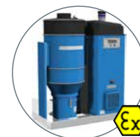
Accessories for cleaning and grinding extraction via high vacuum.