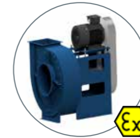
Extractor fans for exhaust fumes, welding fumes, vapours and dust are also available with ATEX rating.