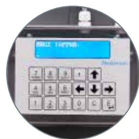
Liquid monitoring systems provide better quality assurance and minimise loss of liquids.