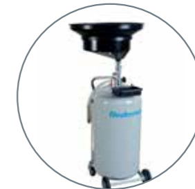
Waste liquid management and mobile liquid distribution.