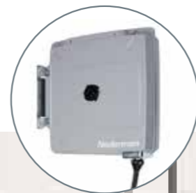
Hose reels for distributing liquids, gas and compressed air.