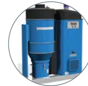
Mobile and stationary vacuum cleaners as well as accessories such as pre-separators, cleaning or hose reels.