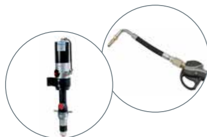
Liquid distribution from central tanks or mobile containers.