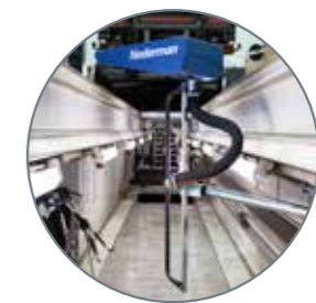
Safe and flexible waste oil rail with cleanable filter and adjustable funnel and arm.