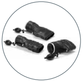
Exhaust nozzles with different shapes and attachments to fit all blowers.

Exhaust extraction for fixed installations, swivel arms and rail-borne systems.