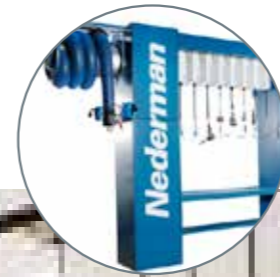
Oil taps mounted in service towers, service gauges, in oil cabinet walls or ceilings exactly according to your requirements.