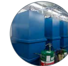
Tanks for bulk liquids that are pumped out to hose reels, and the transport of waste liquids.