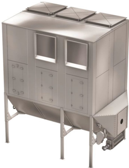
Example: NFKZ3000 2+1 HJ filter with side and top venting for St2 dust

Baghouse dust collector suitable for handling large volumes of air with heavy material contamination levels