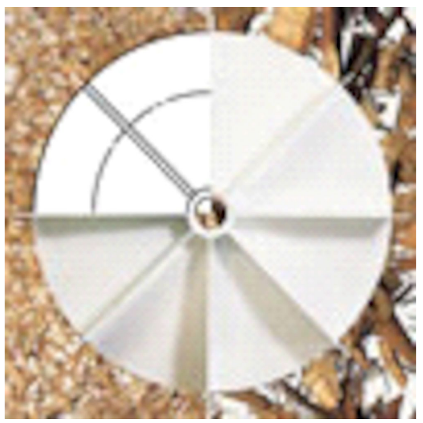
Transport Impeller - Type T The transport impeller is an open, self-cleaning bladed impeller with straight, radial blades. This impeller is used for transport of shavings, chips,

The transport impeller has an efficiency of up to 61%.