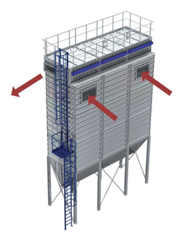
Inlet air (raw gas) and clean air outlet connections

The dirty air enters at high level through the side of the dirty air chamber (as illustrated), or alternatively via the top of the dirty air chamber. It passes downwards through a generously sized pre-separation chamber, and then into the bag-house via a slotted profiled barrier to protect the bags from abrasion in a part cross flow and part down flow pattern, thus eliminating unwanted upward velocity effects. The outlet air connections are at high level directly from the clean air chamber. These may be situated at the sides or end of the clean air chamber. Rectangular connection flanges are normally provided.