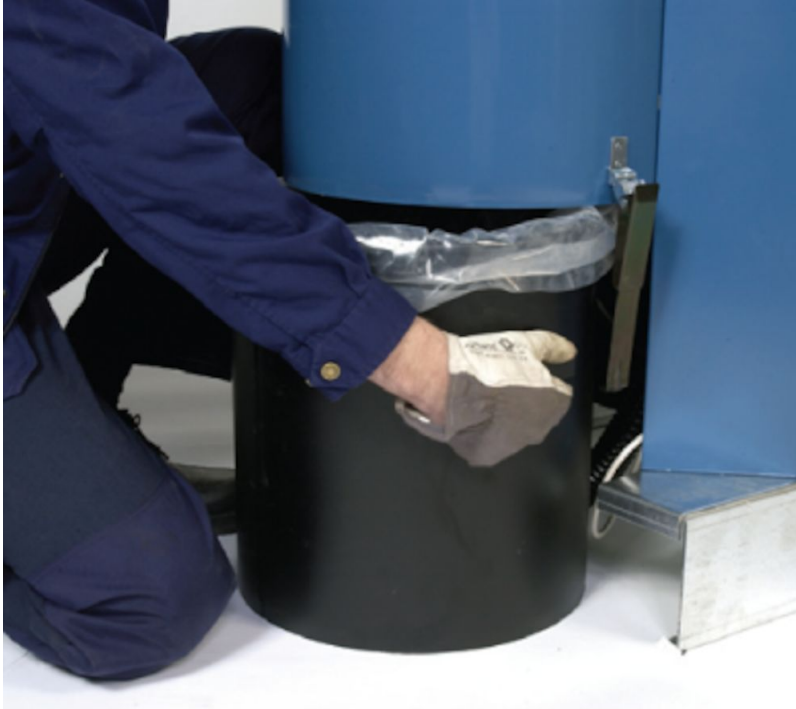
The plastic bin liner is easy to change