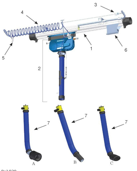
1. Rail 920