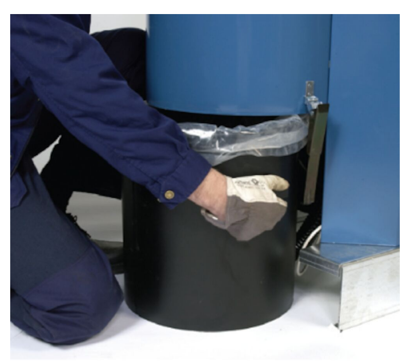
The plastic bin liner is easy to change