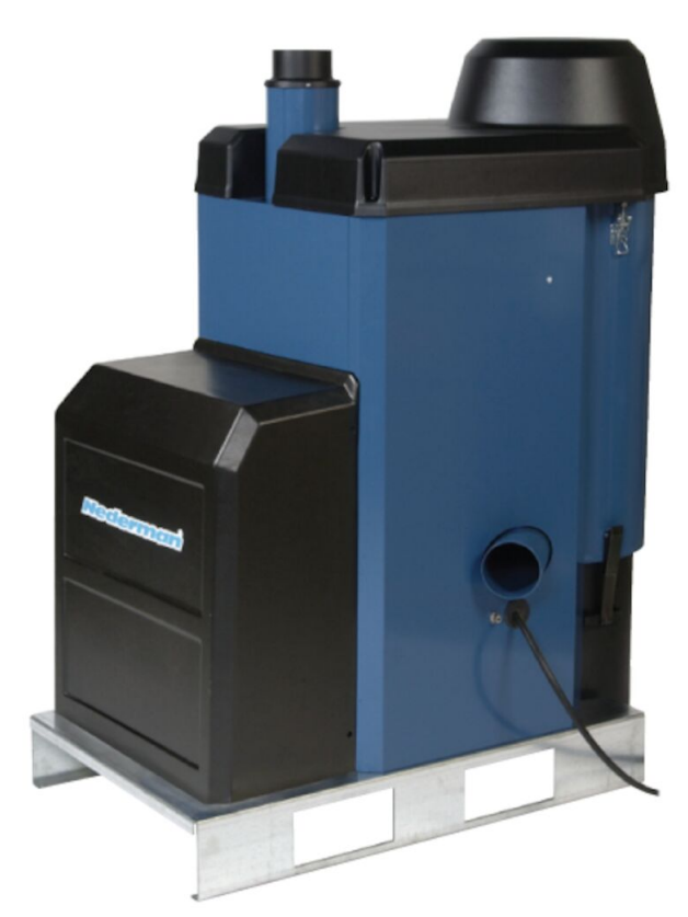
The optional hood reduces the noise down to: 62 dB(A) for L-PAK 150 and 64 dB(A) for L-PAK 250.