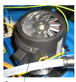
6 Unscrew the plastic cover of the motor (2 screws).