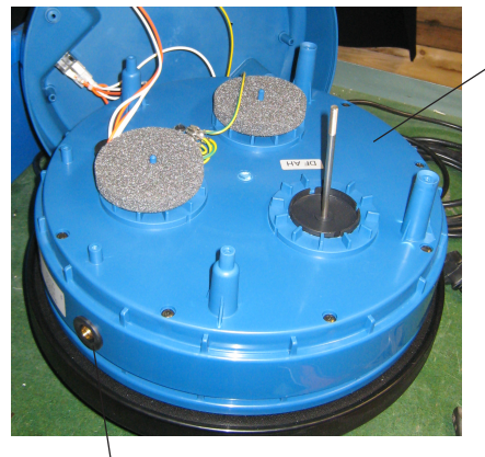
5a Remove the rubber rings (one at each side).