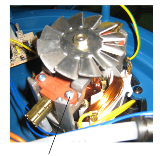
7 Unscrew the carbon holders with carbon brushes.

Remove the carbon holder by bending upwards with a screw driver.