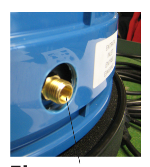
5b NB! Do not unscrew these nipples.5C Remove the middle part.