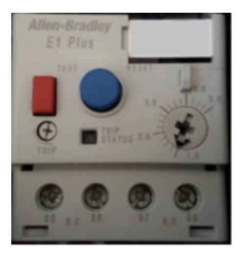
Overload adjustment knob L-PAK 150