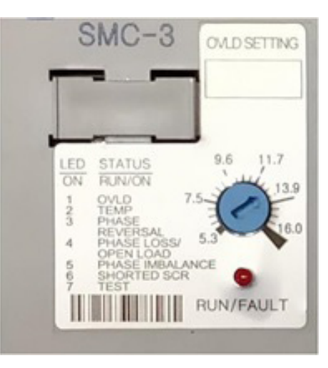
Overload adjustment knob L-PAK 250