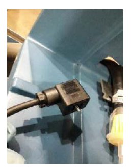
Solenoid without the seal