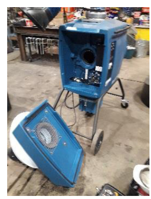
The fan / motor removed