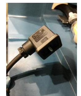
Solenoid with the seal