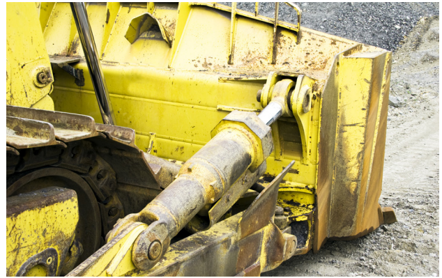
Removes rust on vehicles, metal structures etc.