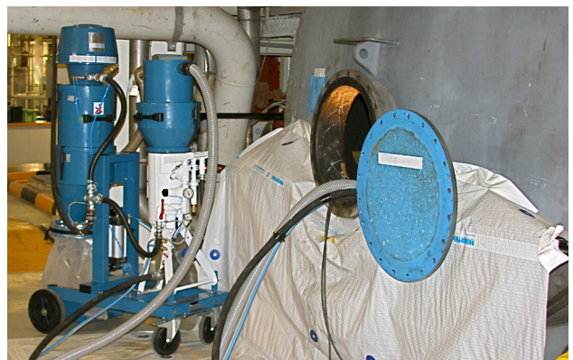
Cleans and clears tanks and vessels safely – even inside