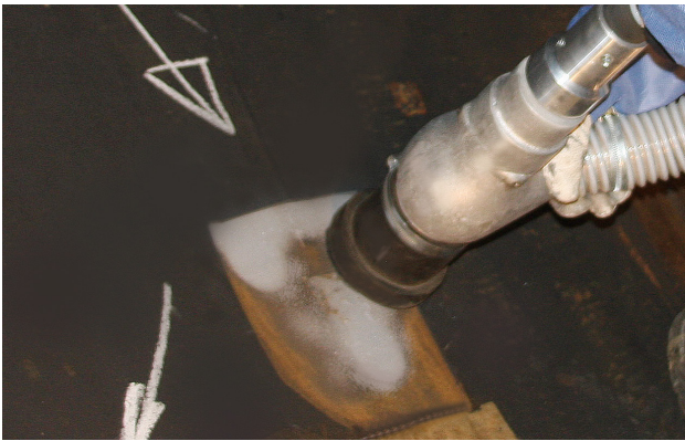
Cleans structures and removes harmful isocyanates that are released during welding and heating