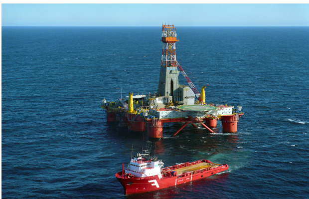
Always to hand for maintenance work and cleaning