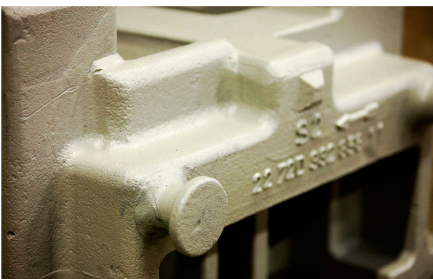
Removes casting beads of aluminium, composites etc.